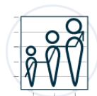
MenaHR® Talent Management System curio