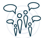
Mena360® 360-degree evaluation system